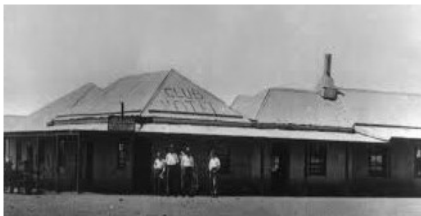
Left: The Original Club Hotel

The Club Hotel unfortunately closed in 2017, and the Shire made the decision to purchase the historic property and restore it, to house Shire Administration, the Library, Function Room, and Council Chambers.