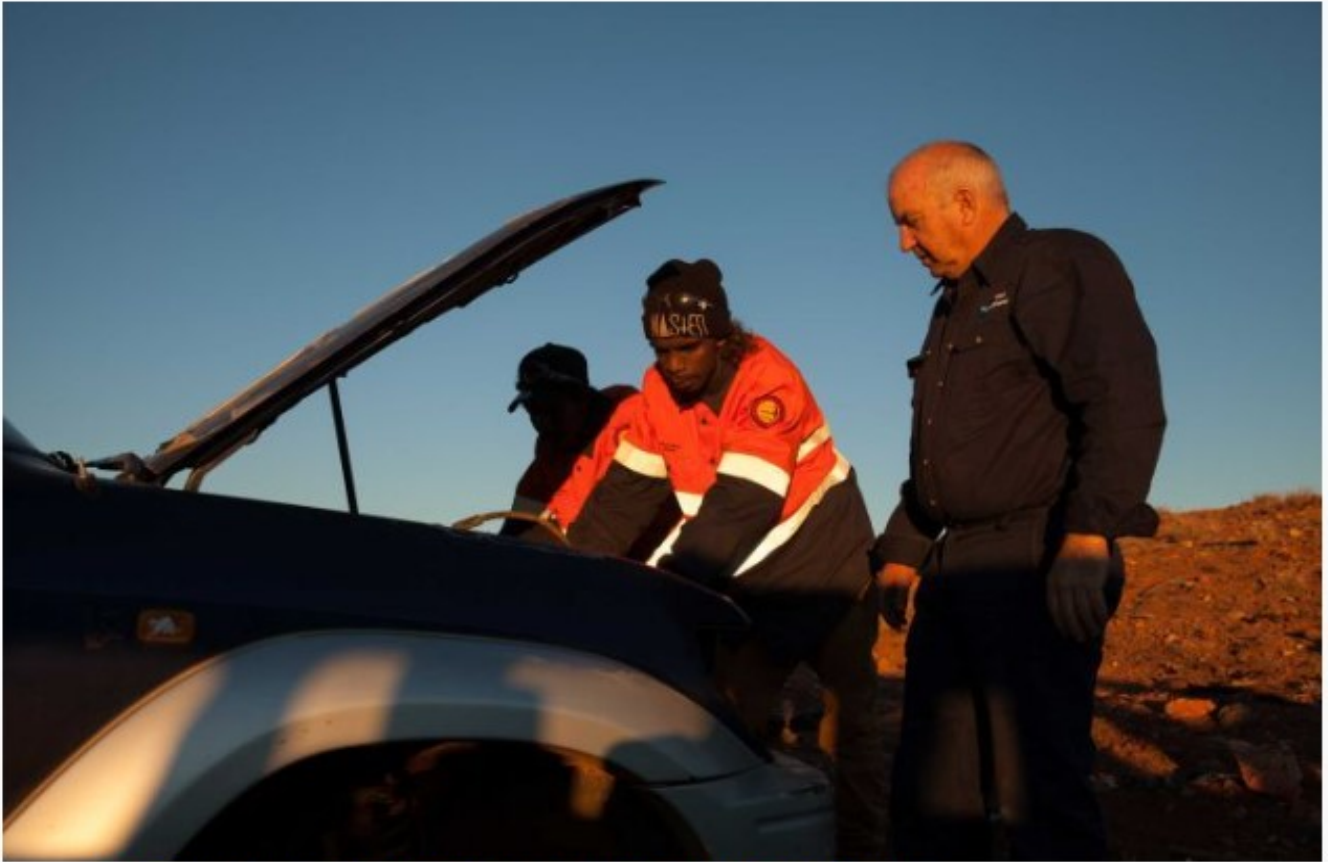
PHOTO: Young Indigenous trainees search for parts at the car graveyard just outside Wiluna. (ABC Goldfields: Tom Joyner)

For many years, the town of Wiluna has had a problem—available jobs but few qualified locals fill them.