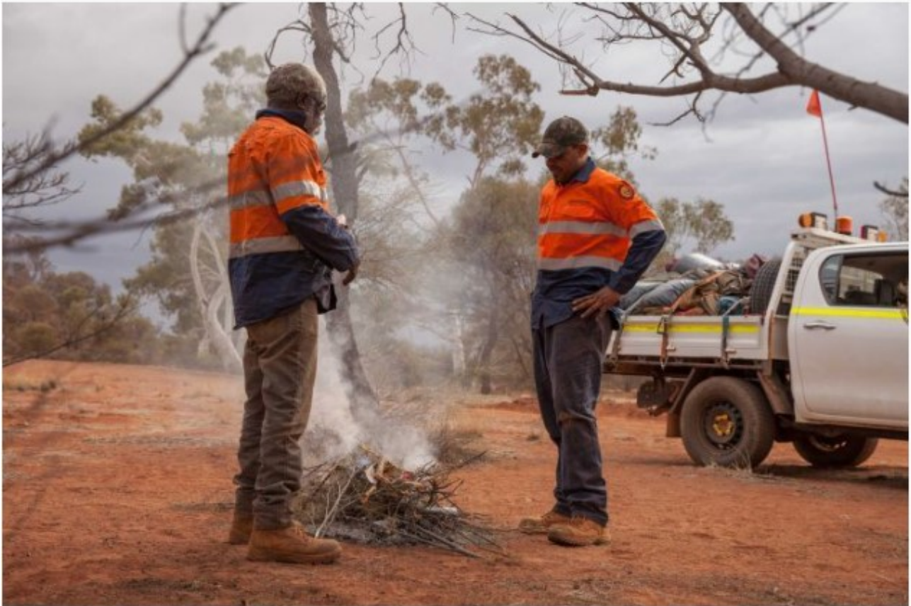
PHOTO: A training centre camp at Wiluna.