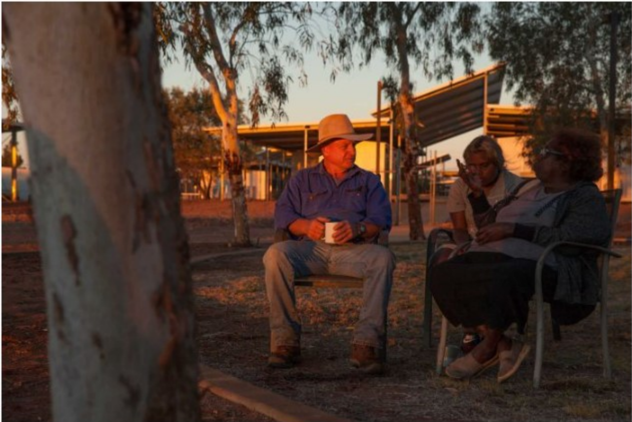
PHOTO: Training at the Wiluna centre is tailored to meet the needs of the local Martu people. (ABC Goldfields: Tom Joyner)