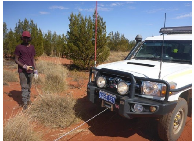
Blondie operating the winch