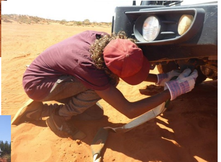
Blondie hooking up the snatch strap